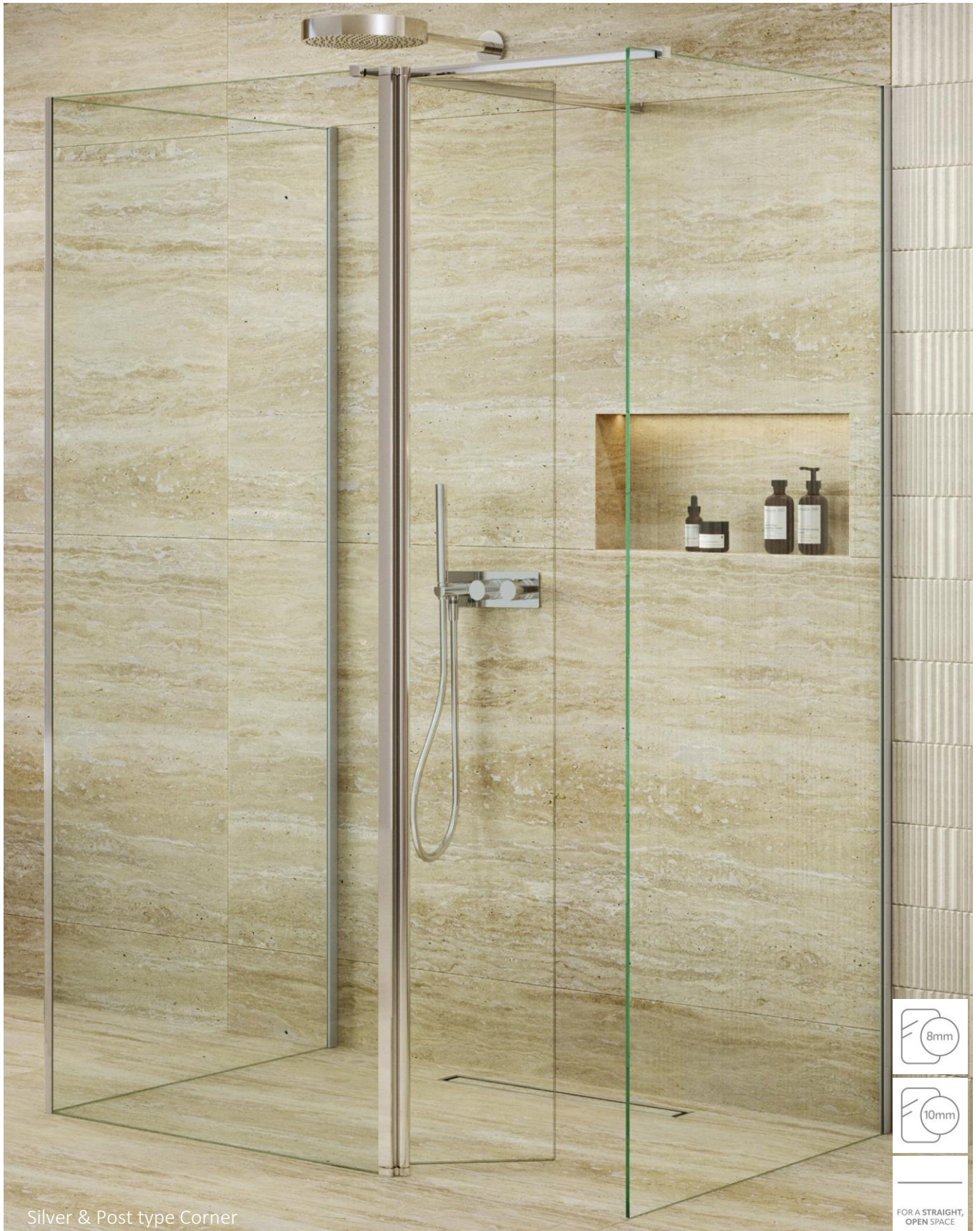
Silver & Post type Corner

Product Data : Config 4 – Flat Wall 3 sided, 270° full height Deflector.